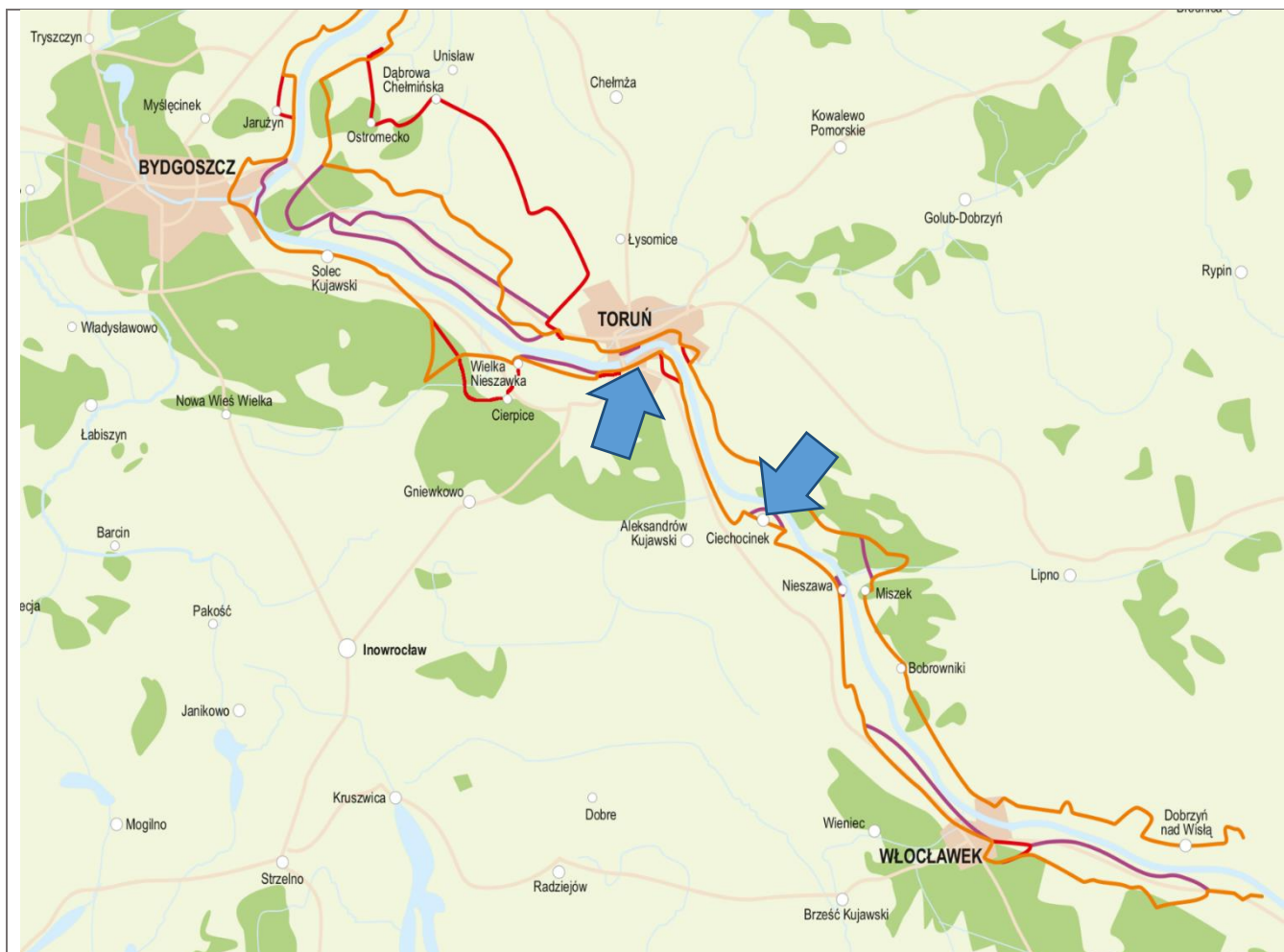
Fig.1. The map showing the course of the VCR in the Kujawsko-Pomorskie Region and proposals for the modification of bicycle routes resulting from the audit. Blue arrows mark the section of the Toruń - Ciechocinek route running along the left bank of the Vistula River.