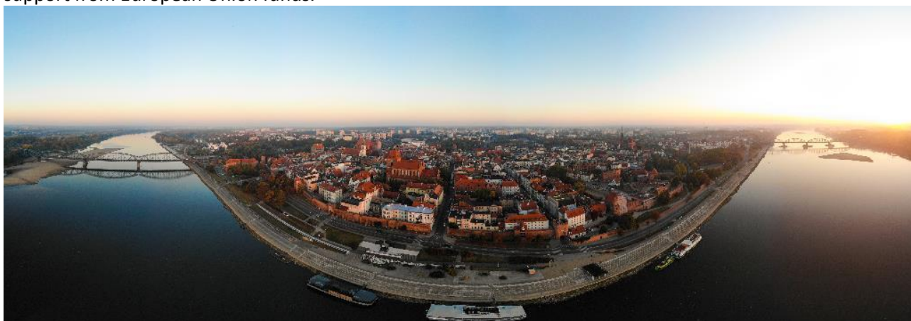
City of Torun

All activities undertaken by the local government of the region in the field of bicycle tourism were possible thanks to the support from the European Union. Continuation of these activities and creation of a professional bicycle tourism product on a regional scale, attractive for tourists, will not be possible without support from European Union funds.